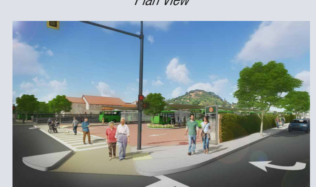
3rd Street & Hetherton Ave, looking northwest