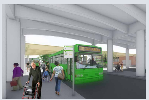
Bus bays under the freeway, looking east