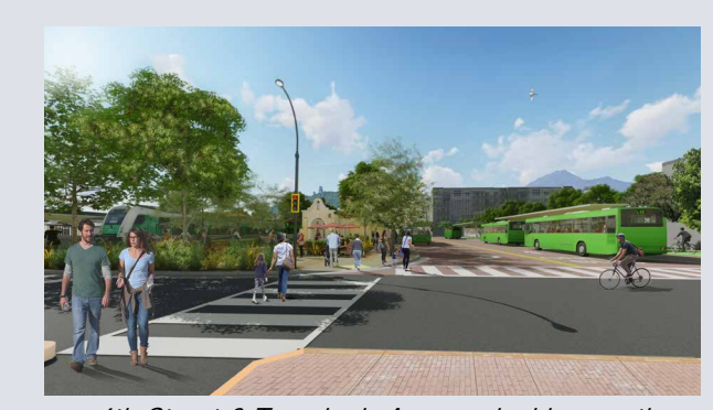
4th Street & Tamalpais Avenue, looking south