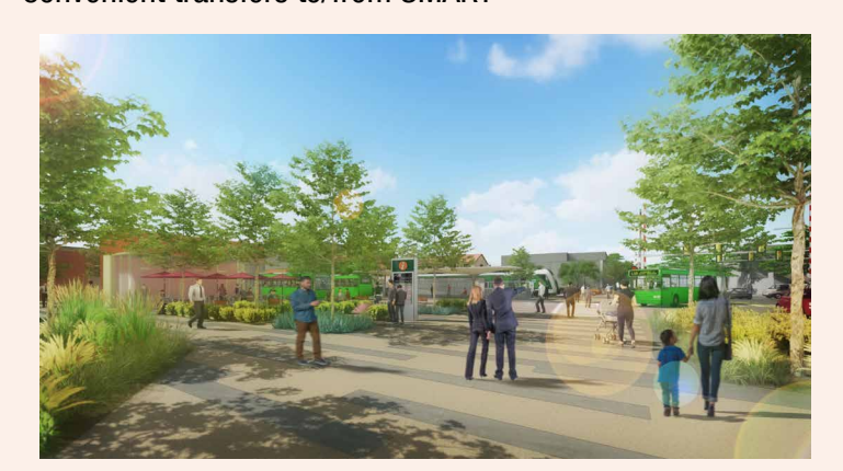
4th Street & Hetherton Street, looking west