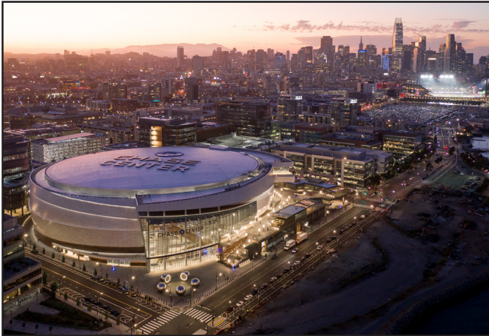
Chase Center Ferry Service drops off at Pier 48, a short walk from the arena.

The new round-trip service departs from the Larkspur Ferry Terminal and drops off at the Chase Center ferry dock at Pier 48, which is located about a 12-minute (.5 mile) flat walk to the arena. The ride between Larkspur and Pier 48 takes about an hour. All ferries have snack bars and a variety of refreshments to make the trip more enjoyable. Tickets are $14 each way and must be purchased in advance online or by calling 877/473-4849 (9 am to 9 pm). Visit goldengateferry.org for more information.