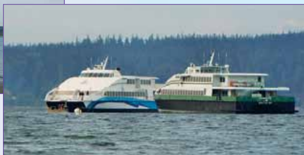
Right: The M.V. Del Norte is re-launched while the M.V. Golden Gate (foreground) awaits haul-out.