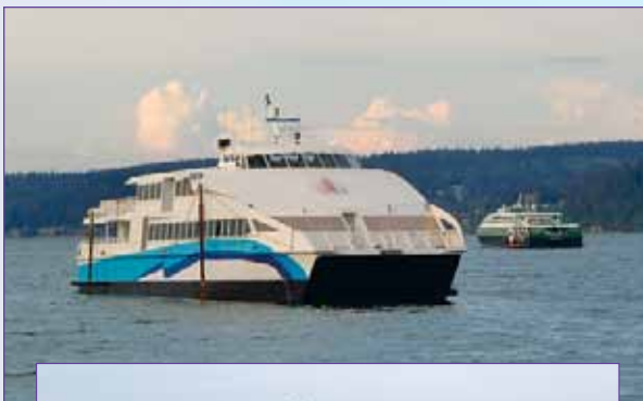
Top photo: The M.V. Del Norte after being launched and the M.V. Golden Gate in the background.

The M.V. Golden Gate is one of the pre-owned vessels the Golden Gate Bridge, Highway and Transportation District (District) purchased from Washington State Ferries in 2009. When fully refurbished, the M.V. Golden Gate will accommodate 450 passengers, sport all new equipment, and have all spaces newly renovated. The M.V. Golden Gate will be out of service approximately six months, undergoing major interior and exterior refurbishment.