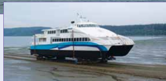
Bottom photo: The M.V. Del Norte being launched.