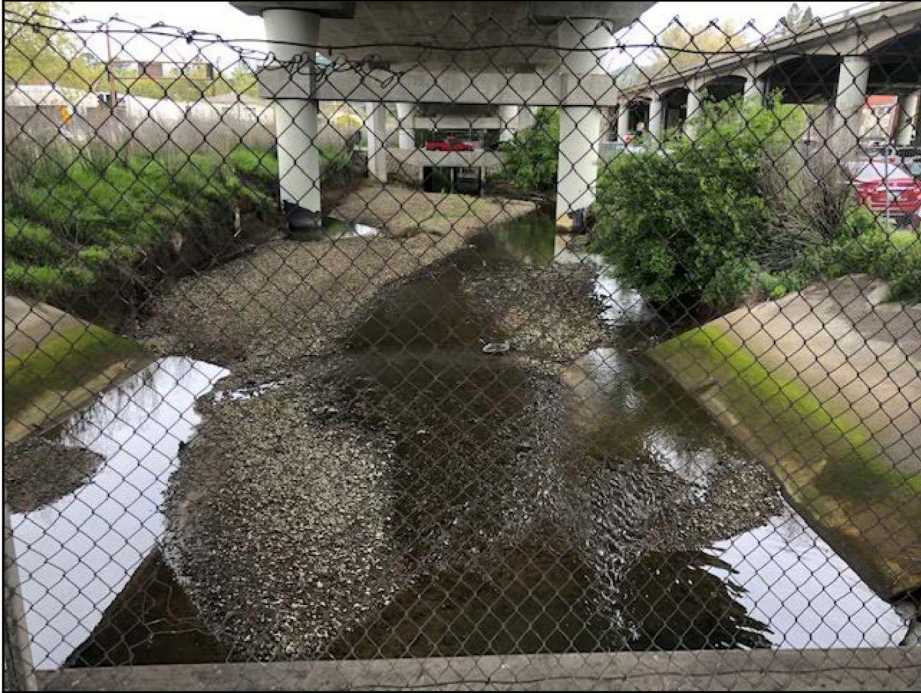
Figure 1. View upstream of Irwin Creek from 4 th Avenue at proposed site.