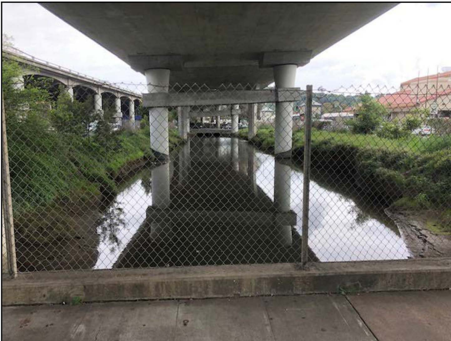
Figure 2. View downstream of Irwin Creek from 5 th Avenue at proposed site.